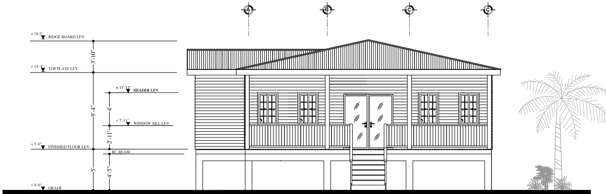
FRONT ELEVATION SCALE: 3/16" = 1'-0"